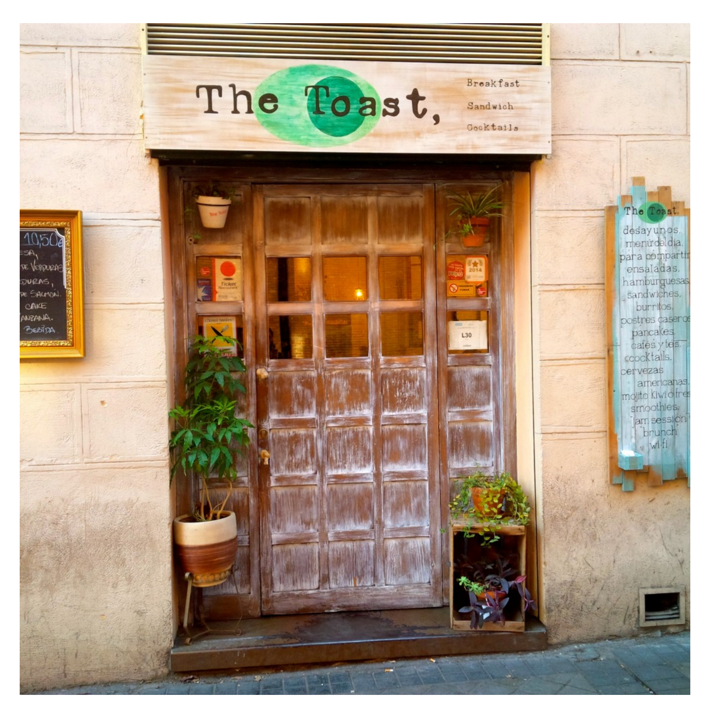
Start off with a generous Bloody Mary as you consult the

From the hanging light bulbs encased in mason jars to the freshly squeezed orange juice served in champagne flutes, The Toast is an Instagrammer's paradise, and will satisfy your grumbling stomach too. Just one street over from the Little Big Café, The Toast is nearly always full of content diners lingering over the tasty two course brunch (coffee or tea and juice included) offered on weekends.