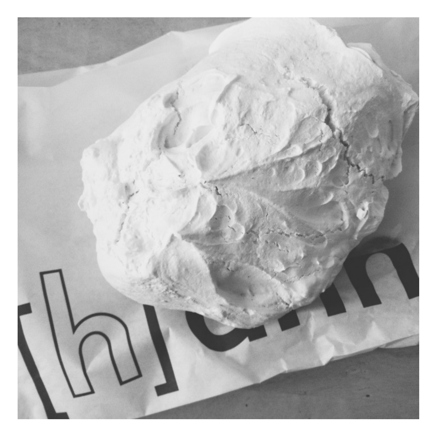
Multiple locations around the city, prices vary.

Here's their <a href="Facebook page">Facebook page</a> and <a href="web">web</a>.