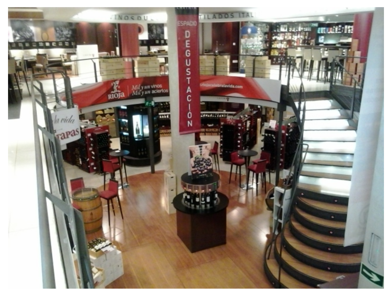
Restaurant on top floor, with decanting machines for wine tasting below

(this month, special cheese and wine pairing), Lavinia is a hub of specialised wine activity. They even have little decanting machines to taste wine in the shop on your own- the perfect way to test your palate style if you not sure what you like yet.