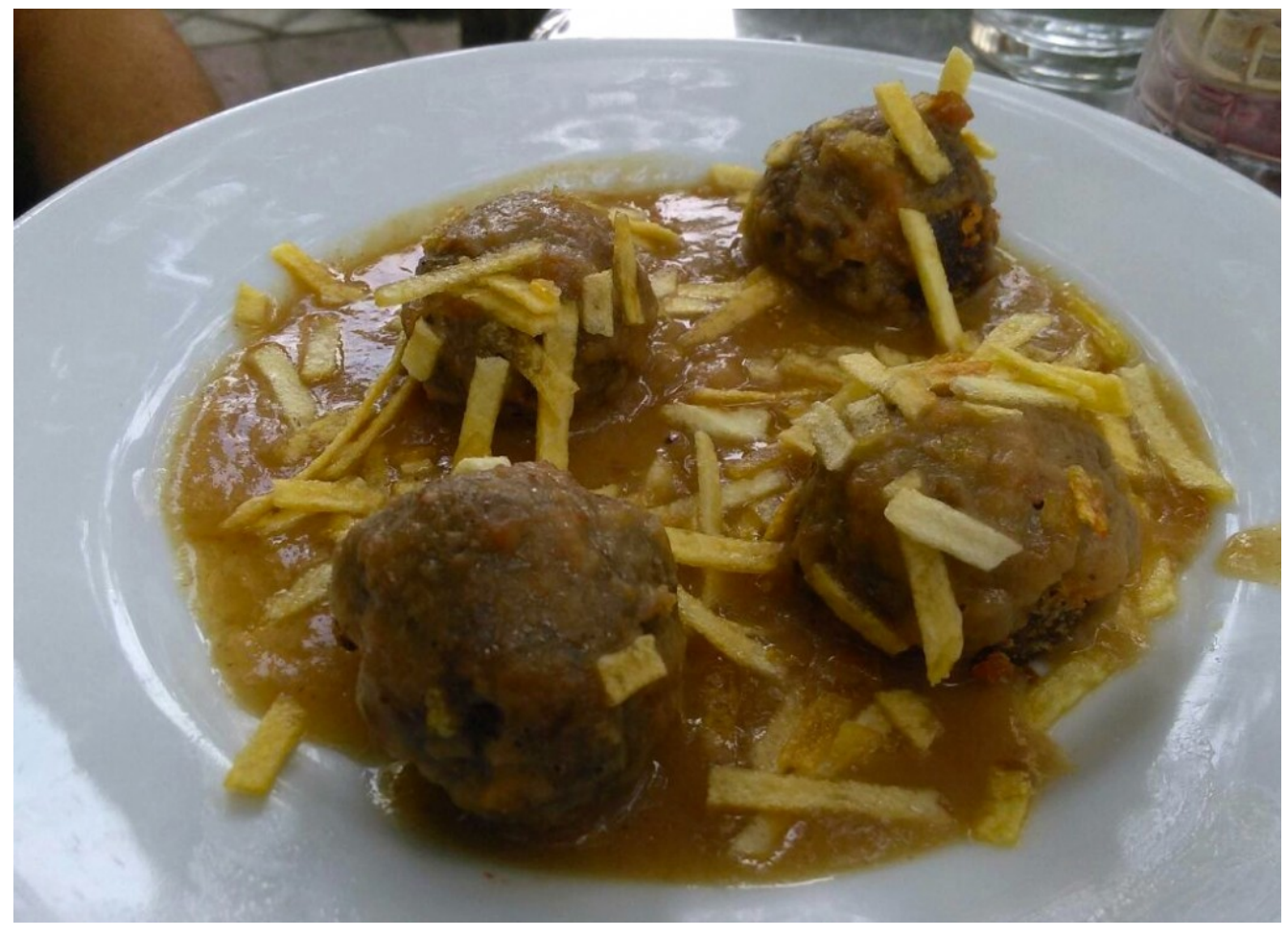
The albóndigas (meatballs) were amazing!