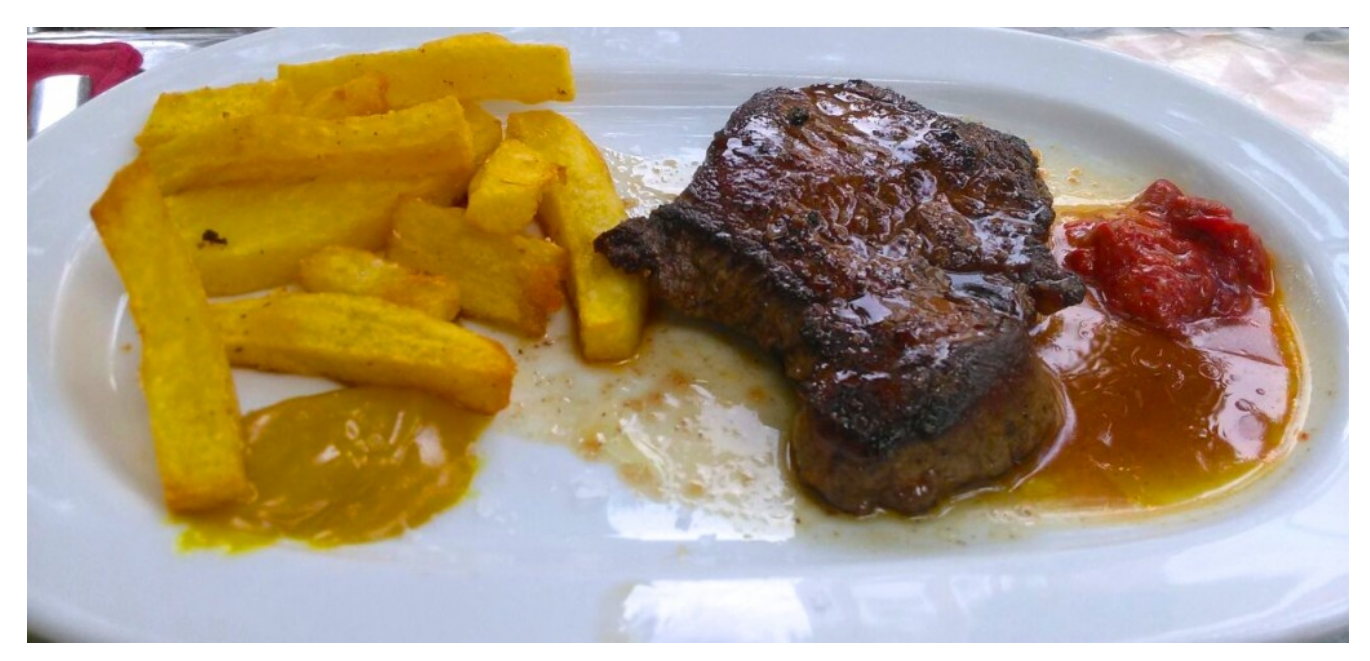
The entrecot was so big that we had to ask the waiter to split it in two. This pic only shows half.

I'm not very fond of fish, but this bacalao was superb.