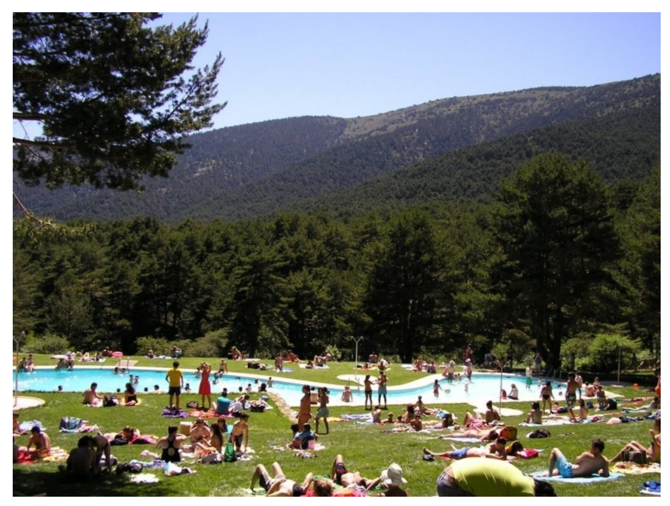
Cercedilla