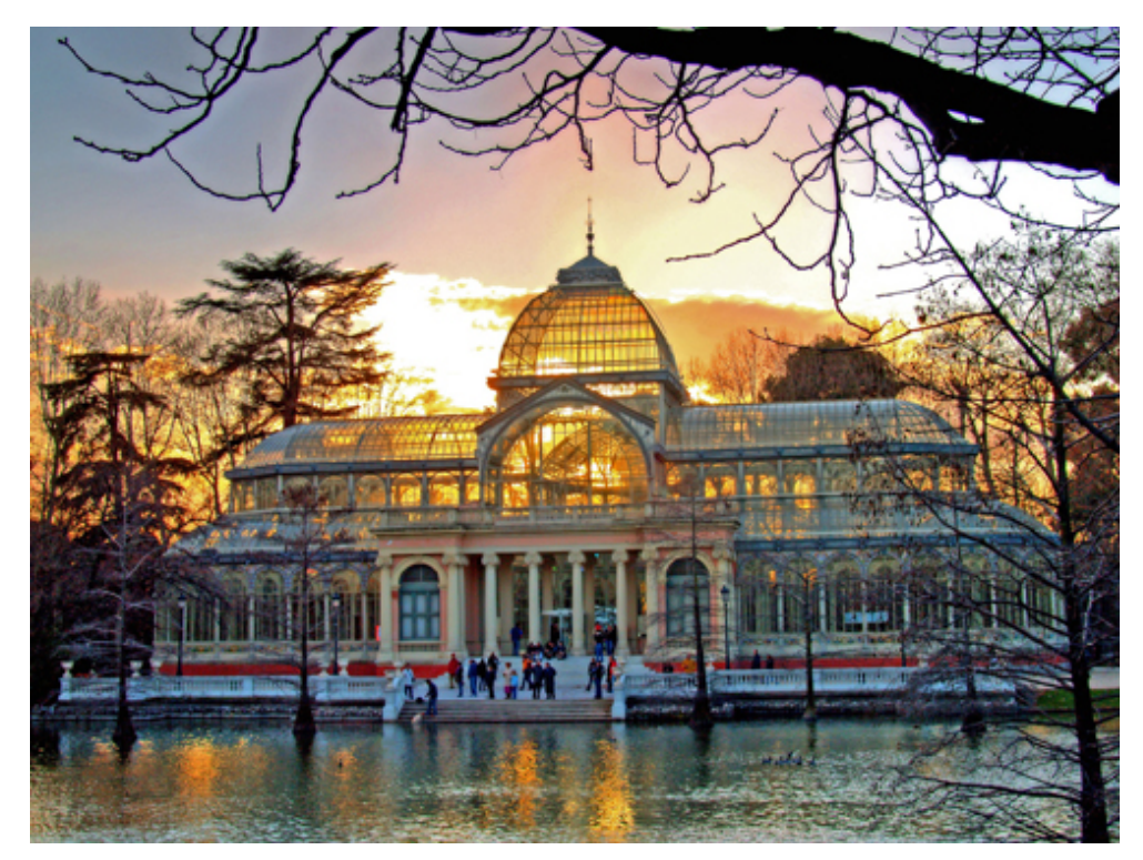
Palacio de Cristal

It is an easy pick but a great place to start with because you get away from the noise and hectic life of the city. You invite your date for an aperitivo to the café (on paseo Venezuela) next to the pond in the centre of the park. However you shouldn't linger too long with the drinks. After the first copa you should take your date to Palacio de Cristal in Retiro or show them the now abandoned zoo that used to be in Retiro. For both do a little research and make sure how to get there because you can get easily lost. My personal favourite is the rose garden located towards the side of Av. De Menendez Pelayo. It is incredibly impressive when you walk along and are met by a resident peacock. It will also take you to the restaurant. If the sun is setting though take the route to Palacio de Cristal .